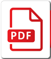
Figure 19: Download Blank California Writ Of Habeus Corpus Select Download Format: learn more about longitudinal writing